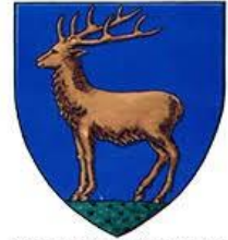
Consiliul Județean Gorj